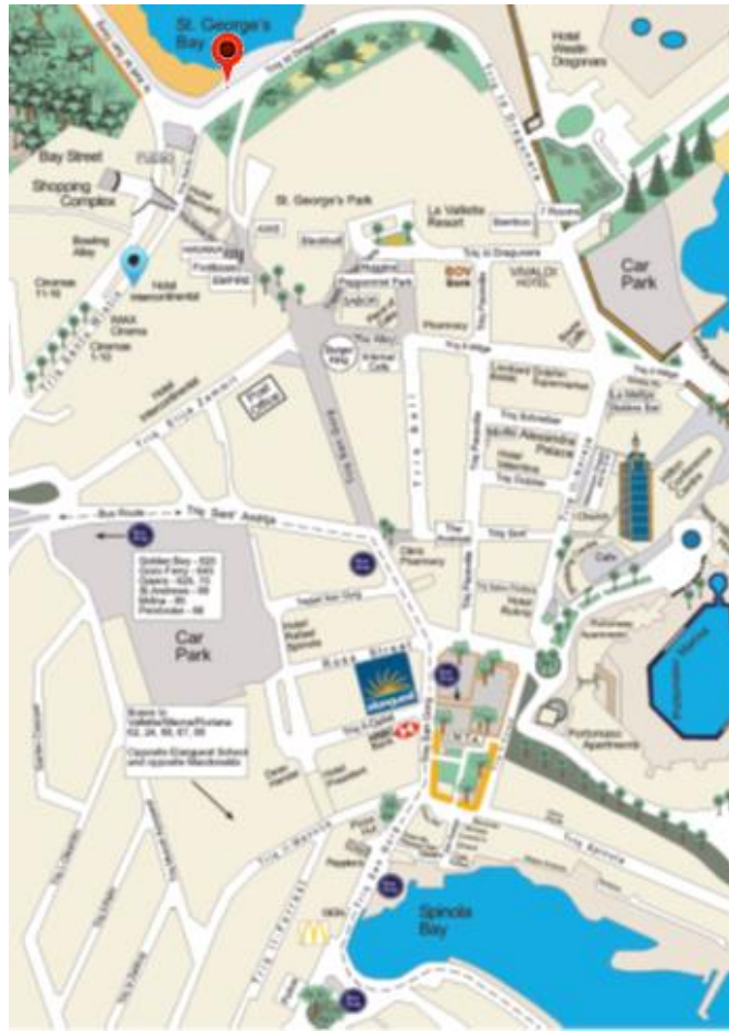
📍 Conference Hall, Cettina De Cesare (CDC), is in hotel.